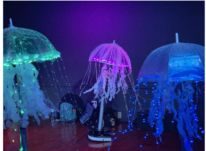
Fig. 1. Robot jellyfish performing in robot comedy show Singu-Hilarity

The study will take place as a special exhibit, ideally in a museum setting. Within the exhibit area, there will be two main areas: the observation area and the interaction area, as seen in Fig. 2-3. In the first iteration of the jellyfish behavior,